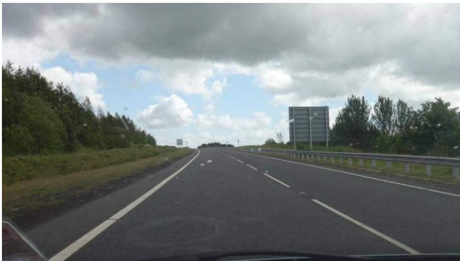
Figure C5: Southbound view along link 10