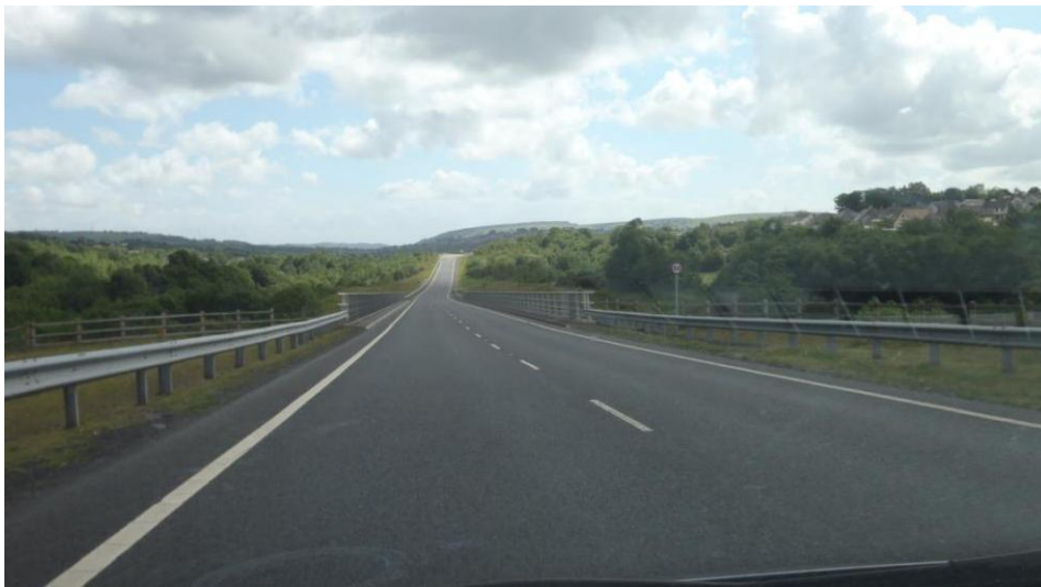
Figure C4: Southbound view along link 11