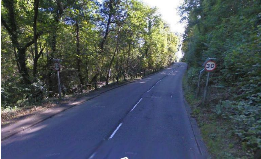
Figure C3: 30mph gateway signs on entrance to residential area