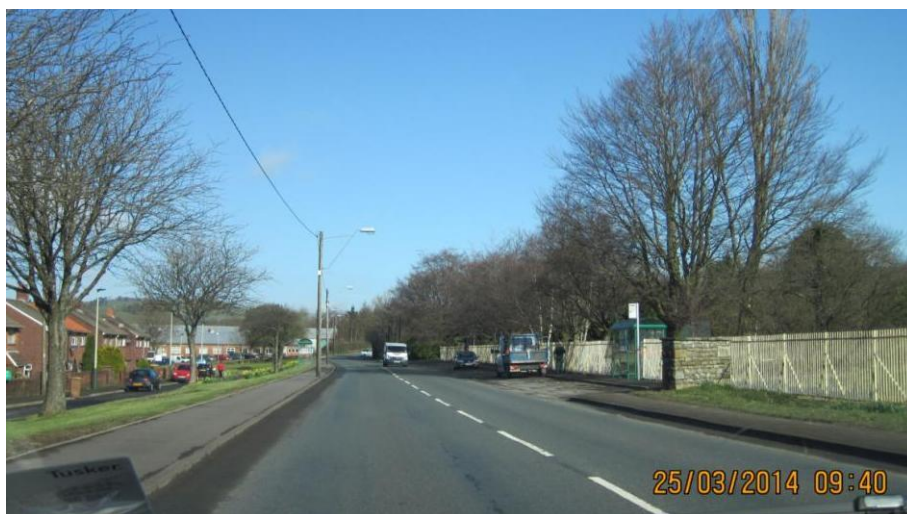
Figure F2: Northbound view next to Britannia village

N.B - Before increasing the speed limit it is worth looking at the visibility of Britannia Terrace for those attempting to access on to the A4049. The side junction of Britannia Terrace is located on the A4049 bend approaching Britannia.