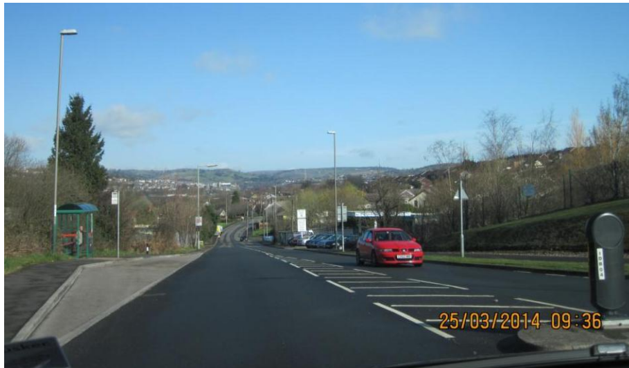
Figure F1: Northbound view along southern section of link 3.

The link can be split into two different sections according to the carriageway's characteristics. The southern section from the start of Fleur-de-Lys to Oak Terrace By-pass traffic lights has a very wide carriageway with pedestrian crossing points at a number of locations. There are footpaths on either side of the road, as well as nearby primary and secondary schools including Ysgol Cwm Rhymni. This route generally has minimal frontage development. The northern section from the traffic lights up to Fairview signals is more residential with several driveways leading onto the carriageway. Here the carriageway and footpath is narrower. The data was taken from the widest point of the carriageway next to the bus stops near the Bryn Road traffic lights.