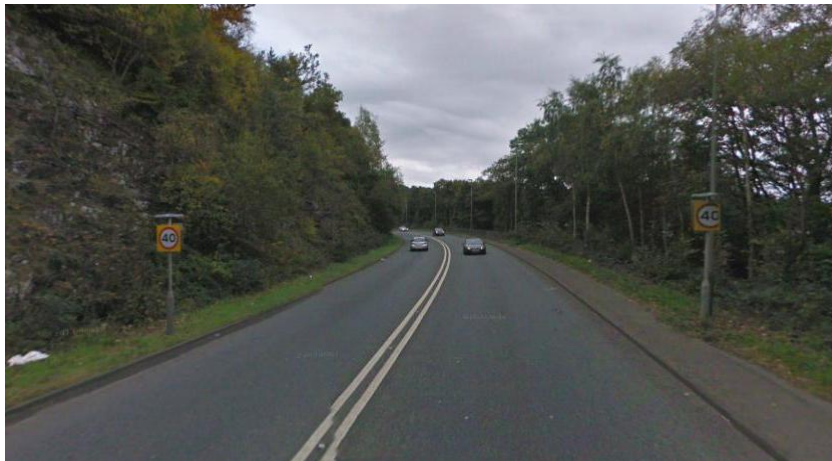
Figure A1: Northbound approach to the 40mph section

This consists of a very short 40mph speed limit section with a wide carriageway that curves gradually in a north-south direction. The link contains a continuous footpath next to the northbound lane. The link does not include any adjacent development or junctions, however a major junction leading towards Panside is located just south of the link, where the speed limit is 30mph and the nearby area includes several adjacent houses and parked vehicles. To the north is a national speed limit section that leads towards Crumlin traffic lights. The 40mph section is used to slow down southbound traffic that's travelling around the slight bend towards Panside junction, where cross road vehicle movements and congestion can occur.