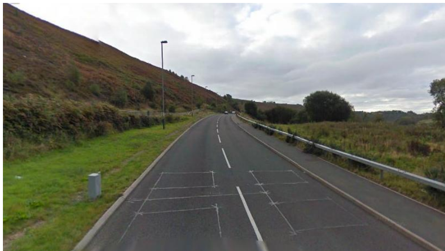
Figure F3: Southbound view between New Tredegar and Aberbargoed

Single carriageway road of standard width, there are a number of right turn holding lanes. The route is in a rural environment with a steep fall to one side of the carriageway that is protected by speed barriers for most of the route. Footpath is provided on one side of the road. There is no adjacent development and few side junctions, the link has street lighting.