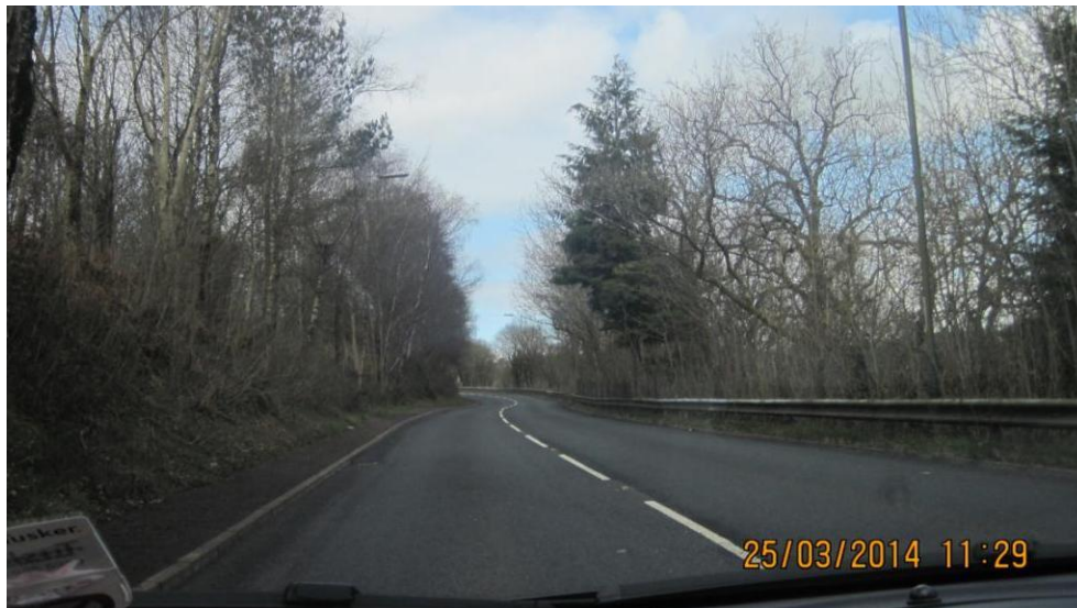
Figure E2: Single carriageway road between Argoed and Hollybush

The link consists of a rural single carriageway road that includes a few bends. The carriageway is of standard width, an intermittent footpath is located on both sides of the road. There is no adjacent development next to the road, however there are some junctions and at one point houses are within sight of the carriageway. One of the road's side junctions provides access to Markham village, whilst the majority of the junctions provide access to country lanes. Safety barriers are located next to the southbound lane for large sections of the route.