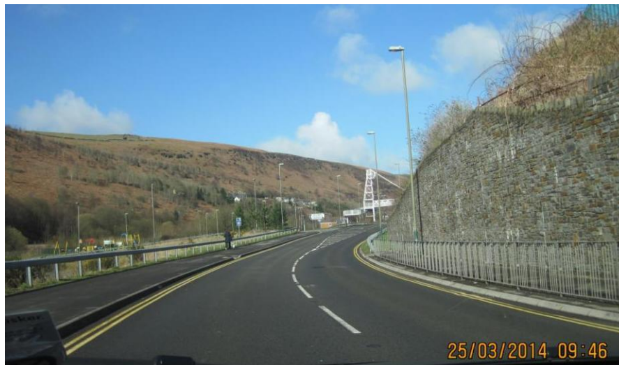
Figure F4: Northbound view in the southern section of the link