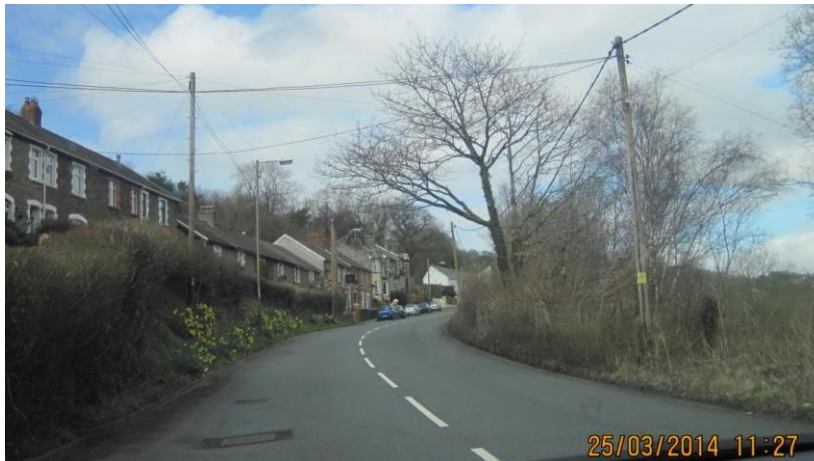
Figure E1: Carriageway section to the south of Argoed village

The link contains a fairly straight carriageway with good sight lines through Argoed village. The village is long and narrow. Several rows of terraced housing are located next to the northbound adjacent to the carriageway, additional housing/development is set back from the main road on both sides of the main road. Several parking bays are located outside along the route. The carriageway is of standard width for the majority of the route, although there are also some horizontal/central hatch markings within the carriageway that aims to visibility reduce carriageway width to manage the speed of traffic. A small section of route near to the southern edge of Argoed village bends and undulates slightly. There are a few junctions along this link, whilst the data was collected near to Penylan Rd junction, where the carriageway is relatively wide.