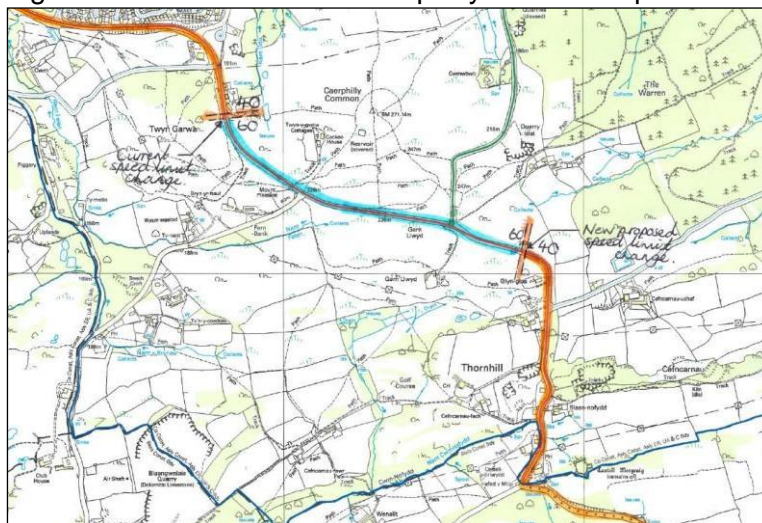
Figure F9: The proposed speed limit changes along Caerphilly Mountain