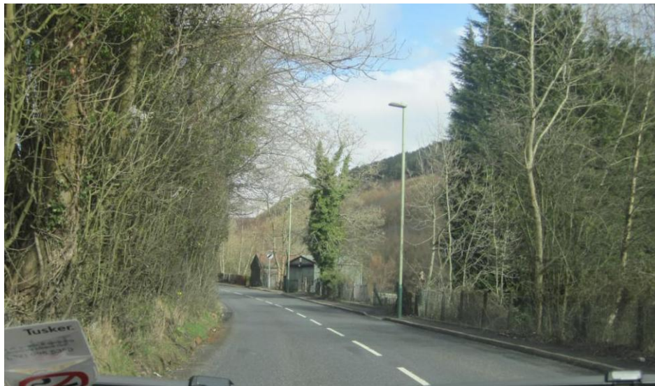
Figure E3: Poor forward visibility of national speed limit signs