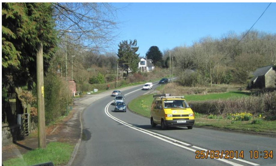
Figure C7: Northbound route near the county boundary

The link can be split into two different sections, the southern and northern sections. The southern section next to the county boundary includes a carriageway that winds and undulates, and contains restricted visibility for motorists. The northern section is straighter, bends less and has a wider carriageway. The data was collected in the northern straighter section near to the Mountain Rd junction. The whole of the link is located in a very rural environment.