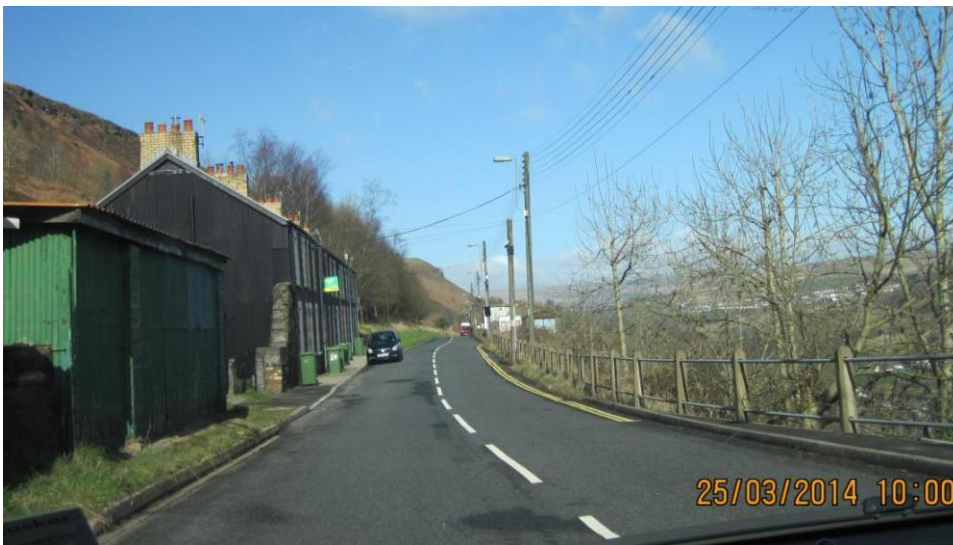
Figure C1: A469 route through Tirphil village

The link consists of a straight section of carriageway with good sight lines through a very short residential area that contains less than 20 houses. There are no junctions throughout the village, whilst the width of the carriageway is slightly narrow. The link contains two rows of terraced housing on different sides of the carriageway, which are not adjacent to each other. A few parked cars are located outside these terraced houses, whilst on the opposite side of the road double yellow lines restrict any parking. Footpaths are located outside the terraced housing, however they are limited and footpaths are not present on any section of the route on both sides of the road. The link is between two 40mph speed limits in a rural environment.