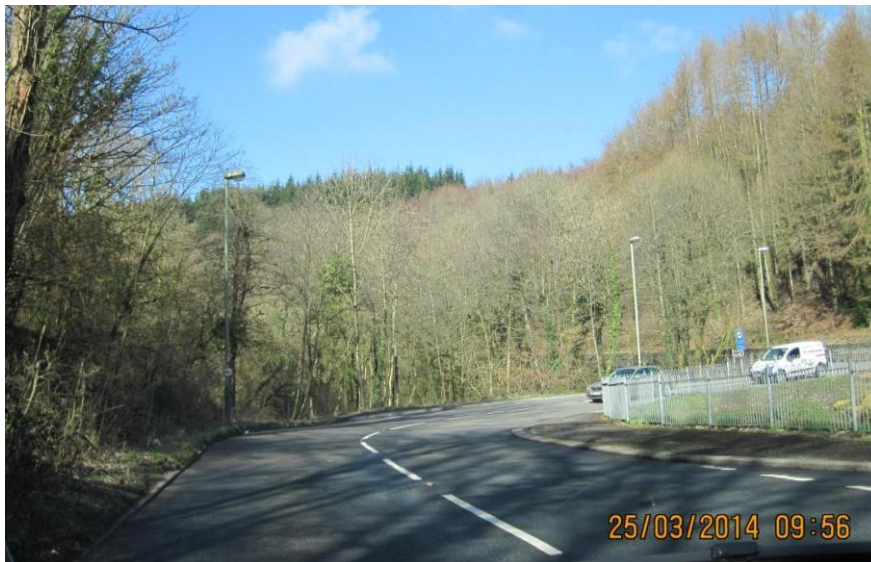
Figure C2: Hairpin bend next to Deri Junction access

This is a very short section of 140m that includes a junction and property access on a hairpin bend. The carriageway has very good width and includes a footpath next to the southbound lane. A national speed limit is located to the north of the link, whilst there is a small residential area with a 30mph limit to the south. 40mph speed limit signs for oncoming southbound traffic are located extremely close to the bend, and there is arguably not enough warning of the bend ahead. The 40mph section is used to control approach speeds to the bend.